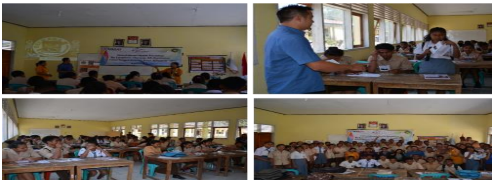
Figure 2. Activities at SMA Negeri 1 Amanuban Tengah, Timor Tengah Selatan

In addition to providing information about local plants that can be used as a natural alternative to mosquito repellent, the participants were also provided with presentations, a demonstration, and videos about simple techniques for using these plants so that they function as safe and inexpensive mosquito repellents. In this campaign, the participants were informed that the simplest thing to do is to cultivate these local plants around their houses and neighbourhoods. As indoor plants, the plants can be placed in the corners of the room to serve as a mosquito repellent medium. While for placement outside the home, it should be positioned near a door, window, or other air vents so that the scent of plants is delivered by the air into the room. Figure 2 show community service conducted at SMA Negeri 1 Amanuban Tengah.