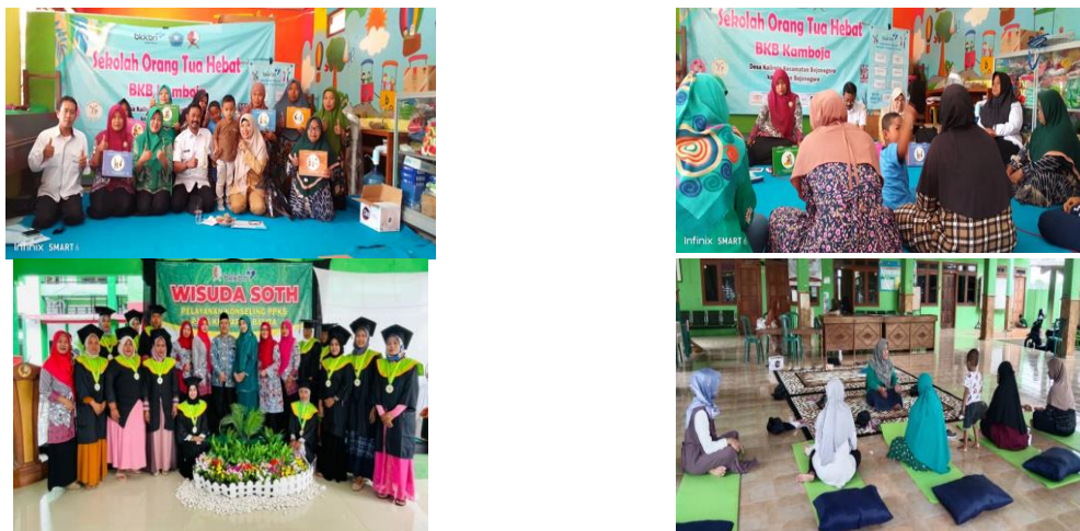
Figure 2. Implementation of SOTH

In addition, PKK cadres also serve as facilitators who assist in monitoring the growth of children in their villages. They actively provide education to mothers about the importance of balanced nutrition and good health practices. Furthermore, PKK cadres also oversee the cleanliness and sanitation of the environment, ensuring that the living environment of children remains clean. Not only that, they also provide counseling to mothers with children who experience stunting and regularly monitor and report to relevant authorities so that necessary actions can be taken promptly. With their holistic and integrated role, PKK cadres become the forefront in the efforts to prevent stunting in the community. Research results also support the importance of the role of PKK cadres in preventing stunting. Findings indicate that villages with active and trained PKK cadres tend to have lower stunting rates compared to villages with fewer active PKK cadres. This emphasizes that the involvement and active role of PKK cadres in educating the community about stunting, promoting balanced nutrition, monitoring child growth, and maintaining environmental cleanliness play a crucial role in addressing the issue of stunting. Therefore, collaboration between PKK cadres, the government, and the community is vital in efforts to prevent stunting and achieve a better public health target. In the context of efforts to prevent stunting, the interaction with a