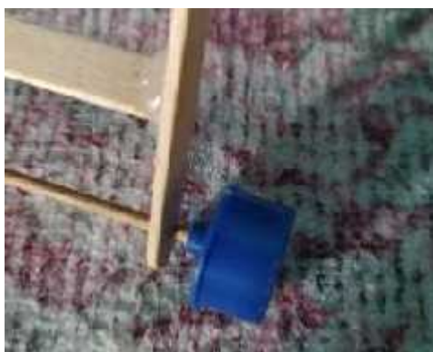
Figure 6 The first tire of ETR media

The ETR media had changed and improved. These improvements were the result of FGD that had been conducted with groups and experts. The first improvement was made to the media tire. Media tires were so small and there was an imbalance between the media body and the tire so that the tires changed.