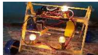
Figure 11 The light of lamp after repairing

Subsequent improvements were made to the support the front media body that was connected to the dynamo. The cantilever was unable to withstand the weight of the front body of the media which was too heavy so that it was repaired twice.