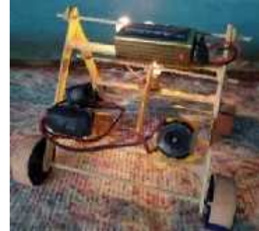
Figure 20 The ETR media product at backside without lamp lit

The improvement process was carried out based on the results of the FGD conducted with the learning device development team with the direction of several facilitators. The ETR media was repaired again to get well and optimal results. The process of improvements was conducted to see the feasibility of the product that was made based on its implementation on STEM conceptually learning, conformity with the mapping of basic competencies, and grade levels of students in elementary schools. After the ETR media went through a validation process through FGD activities, and improvements, the final product was obtained, ETR media for STEM learning based on 4C skills in elementary schools. ETR media was designed the sixth grade elementary school students. This media was able to contain learning materials for electrical components and their functions, speed, and explanatory texts on "Electricity, contextual discussion of" Changing Faces of the World "that integrated science, mathematics, and Indonesian subjects. ETR media products are expected to be one of the solutions and alternatives to support thematic learning in STEM learning. The use of instructional media in elementary schools needed to pay attention to the large benefits. The media can function thematically rather than division in certain subjects (Fristoni, 2013; Oktavianti & Wiyanto, 2014).