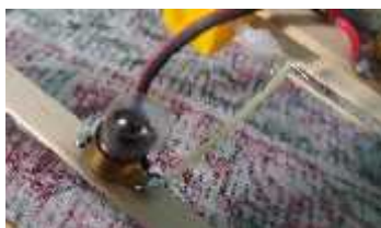
Figure 12 The first cantilever of ETR media

Subsequent improvements were made to the support the front media body that was connected to the dynamo. The cantilever was unable to withstand the weight of the front body of the media which was too heavy so that it was repaired twice.