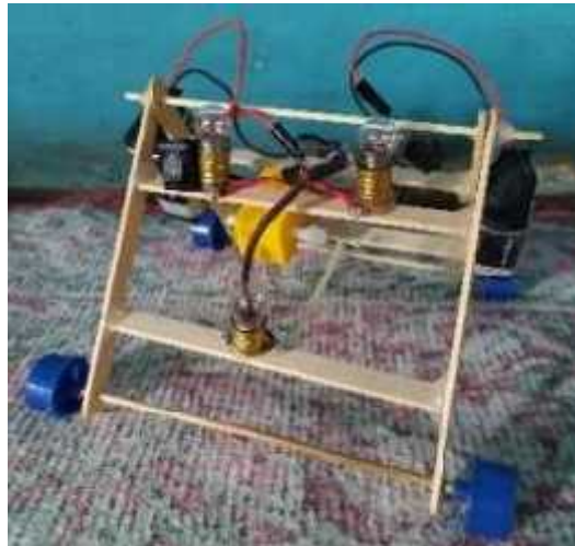
Figure 5 Pre-design of ETR media

The first FGD discussed the design of learning media related to the basic competency in the sixth grade elementary schools. In the first FGD process, the results of ideas related to the media were ETR media. The next FGD discussed the development of ETR. The discussion started from the KD that underlies the media creation to the results or the final product of the media. After conducting the FGD, the ETR media was made, although there were still many shortcomings such as the non-progress of the media.