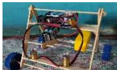
Figure 10 The series of lamp after repairing