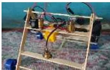
Figure 9 Pre-series of ETR media lamp

Improvements were also made to the electrical circuit that were installed in the front of the media. Repairs were made to the wiring and lighting to produce a good and functioning circuit so that the lights can be lit.