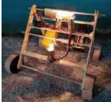
Figure 18 The ETR media product at the front side without lamp lit

After several repairs have been made, ETR media must be validated beforehand by several experts in their fields, especially instructional media experts. The purpose of the validation process was to determine the feasibility of the learning media design results. The results of this validation test showed that ETR media was worth testing in the learning process with consideration of improvements to some parts of ETR media.