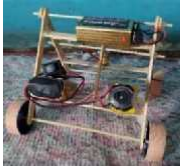
Figure 19 The ETR media product at the front side with lamp lit