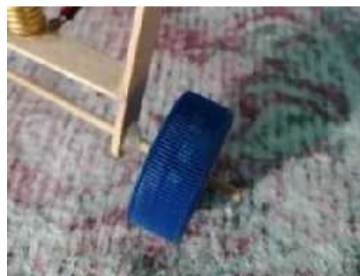
Figure 7 The tire of ETR media has changed

After the tire was replaced, there were still shortcomings. Tires of the media were slippery so that the frictional force was very small. For this reason, repairs were carried out by coating the tire using wound tape. As a result, the tires became slippery and the friction forces became larger.