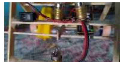
Figure 14 The first cantilever of ETR media after the second repair

After improvements were made, the media were lack of progress. Placement of the components was very influential on the media such as the placement of the engine, electrical circuit, and framework of the ETR media framework itself. To make the media move, the placement of some components must be balanced both left and right side. That way the media will move forward well. If the placement was too heavy on the left or right side, the media would not advance forward but rotated to the placement.