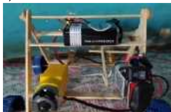
Figure 16 The placement of engine component of ETR media on the first repair