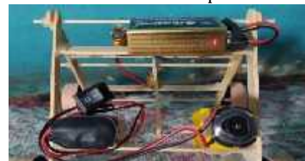
Figure 17 The second placement of engine component of ETR media