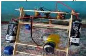
Figure 15. The first placement of engine component of ETR media

After improvements were made, the media were lack of progress. Placement of the components was very influential on the media such as the placement of the engine, electrical circuit, and framework of the ETR media framework itself. To make the media move, the placement of some components must be balanced both left and right side. That way the media will move forward well. If the placement was too heavy on the left or right side, the media would not advance forward but rotated to the placement.