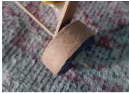
Figure 8 The tire of ETR media has coated

Improvements were also made to the electrical circuit that were installed in the front of the media. Repairs were made to the wiring and lighting to produce a good and functioning circuit so that the lights can be lit.