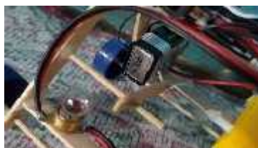
Figure 13 The cantilever of ETR media after the first repair