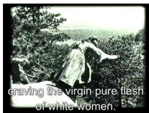
Figure 5. Taboo Language of Vulgarity Type in Sequence 2b