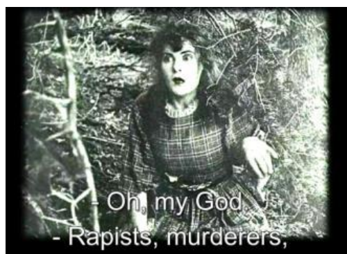
Figure 7. Taboo Language of Obscenity Type in Sequence 2b