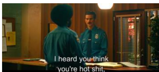
Figure 6. Taboo Language of Vulgarity Type in Sequence 9a

statement was clear. The old white man defined the white women as a holy person, someone that should be protected. They did not want that the white women were being sexually harmed by the black or African-American men. Thus, this showed the hatred of the old white man toward African-American with the prejudice that they craved white women.