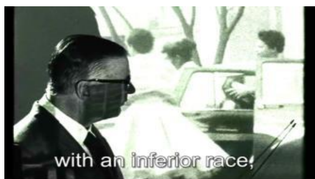
Figure 1. Taboo Language of Epithet Type in Sequence 2b