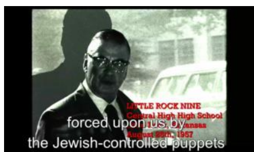
Figure 3. Taboo Language of Profanity Type in Sequence 2b