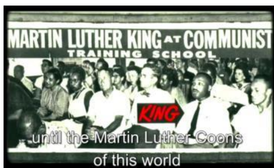
Figure 2. Taboo Language of Epithet Type in Sequence 2b

meaning was the old man was mad that the white children should share the same school with inferior race. The inferior race refers to the Afro-American people. From the Jim Crow era there was a segregation of colored people or Afro-American to go to school with white people. Even though the era of Jim Crow was ended the white people still refused to go to school with inferior race or they still share the same school but avoid them in the society because the superior group thought that their group was not appropriate to socially connected with inferior race.