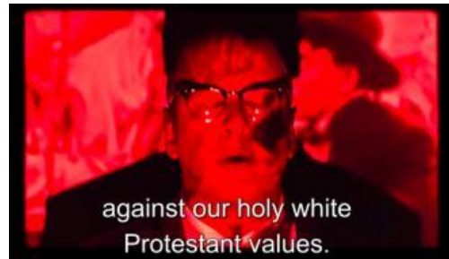
Figure 4. Taboo Language of Profanity Type in Sequence 2b

controlled by Jewish. It could be understood by the word puppet. Puppet was an object commonly resembled human, animal or mythical things in which controlled or animated by puppeteer. The puppeteer that the white man in the BlacKkKlansman film referred was Jewish. The white old man was blaming the Brown Decision because the laws stated that the racial segregation in the public school was unconstitutional and it made them (white people) shared the same school with inferior race or the other race besides white and they believed that the Brown Decision of U.S Supreme Court was controlled by Jewish. The white racist people such as the white old man in the Blackkkklansman film was showed their political ideology of anti-Semitism.