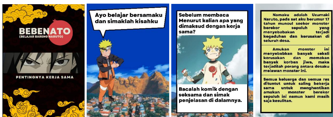
Figure 1. Cover View and Introduction from the Story

adjusting the colour and appearance and adding image objects to make students more interested in understanding it. The cover display and story introduction can be seen in Figure 1 .