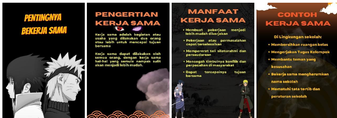
Figure 3. Display of Several Explanations of Cooperation Material on the Media

After the draft media has been successfully developed by the author, the next step is to test the learning media that has been made to find out whether the BEBENATO comic media is suitable for use or not, so it must be validated first. The BEBENATO media validation test was carried out by a media expert. The questionnaire sheet provided by the author contains 20 questions regarding the feasibility of the media in terms of appearance, completeness, and use. The BEBENATO media material validation expert is a teacher from SD Negeri 1 Genting. The questionnaire sheet provided contains 10 questions regarding the clarity of the material, the appropriateness of the material, and the attractiveness of the presentation of the material. While media users are students of SDN 1 Genting. The questionnaire sheet provided contains six questions regarding aspects of the attractiveness of appearance in the media and aspects of presenting material in the media. The media expert validation results can be seen in Table 2.