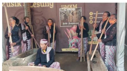
Figure 9. Osing Old Artists Play Mortar Music

Aside from food vendors, there is a shop selling Banyuwangi-style batik cloth and udeng . There are three types of batik cloth: written batik cloth, printed batik cloth, and ready-made garments. In addition, there is a cafe that serves traditional Kemiren coffee and food. This cafe also offers Kemiren village writing.