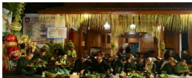
Figure 7. Eating together in the tumpeng sewu ritual

In the afternoon/evening, Kemiren villagers serve tumpeng which is placed in the front yard of their house. Tumpeng means rice that is shaped like a cone of a mountain. In Javanese belief, the tumpeng symbolizes gratitude to the one and only God. Anyone who passes will be offered to eat together. It is called tumpeng sewu because there is so many tumpeng served, so it is called sewu (one thousand). However, in terms of the number of Kemiren residents, who are more than 900 households, the tumpeng served has reached nearly 1,000 tumpeng . Each house serves at least one tumpeng with all the accouterments. Tumpeng Sewu apart from being a form of gratitude for the Kemiren village residents is also meant to clean the village, as a repelling disaster (reject disaster) namely cleaning the village from all kinds of danger. In the Tumpeng Sewu tradition there is local wisdom, that humans must be grateful for all the blessings that have been received throughout the year, but also ask for blessings for protection so that they are kept away from all dangers and disasters.