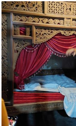
Figure 6. Gembil Mattress, Kemiren (primary source, 2022)

protected from all diseases. While drying the mattresses, residents serve typical Kemiren snacks such as kue kucur abyang (red beancurd cake), cenil , fried egg, bananas, tape buntut , apem cakes, and so on. This dish is intended to be shared as a sign of communal unity in society and as a way for them to express their appreciation for all the gifts they have received. According to Taufik Firmanto's theory, the Osing ethnic group is known as a horizontally egalitarian society in the sense that the social structure is not interpreted hierarchically like Javanese society as a whole. No matter a person's social, economic, or position standing, everyone is treated and appreciated equally during a wedding ceremony, for instance, and they lend a hand to one another. Understanding this mutual assistance is not only in the form of material (called arisan ) but also in the form of energy (called resayan ).