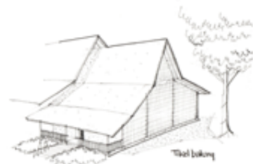
Figure 3. The Tikel Balung House (Primary Source, 2022)

The pattern of spatial division in the traditional Osing house consists of: (1) The very front: bale , serves as a living room. Sometimes it is used for traditional ceremonies in the family; (2) The middle part: jrumah . Jrumah often functioned as a bedroom. Jrumah is a private area in the house because it is only intended for residents and close relatives. (3) The back: the pawon (kitchen) functions as a cooking area. The Pawon area also functions as an area to prepare for the celebration event. In addition to the bale , jrumah , and pawon as main parts of the inner space, the Osing