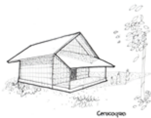
Figure 1. The Cerocogan House (Primary Source, 2022)

The Tikel Balung house is the most complete form compared to the lines and the cerocogan . This house has a village-shaped roof, which has 4 roofs or 4 rab . The tikel house can cover the entire main room pattern in the traditional Osing house.