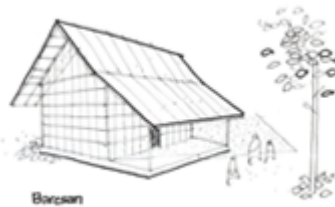
Figure 2. The Baresan House (Primary Source, 2022)