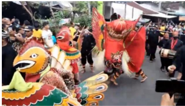
Figure 5. Barong Ider Bumi Procession