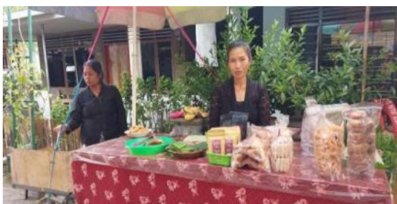
Figure 8. Vendors Sell a Variety of Food; Some Types of Food Are Cooked on the Spot

One of the uniqueness of the Kampoeng Osing market is that the traders selling in the market wear black clothes. The women are dressed in black, and wear typical Banyuwangi batik cloth, while the men in black wear a udeng (headband) typical of Banyuwangi.