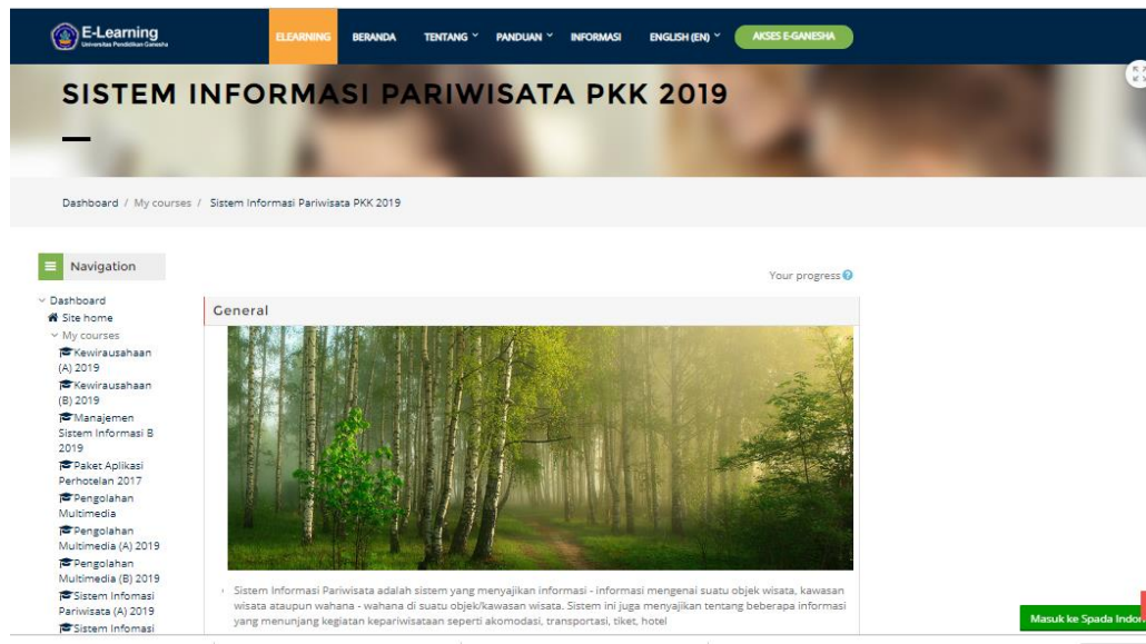
Figure 2. E-learning Modul of TIS