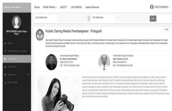
Picture 2. Development of Spada Learning Media

determine the effectiveness of online learning through the use of a t-test and the IBM SPSS Statistics application. To begin, the researchers evaluated the learning design through field trials. Both evaluations assessed student learning outcomes following the implementation of online learning activities. Based on the analysis of the data obtained, it was determined that there was a significant increase in student learning outcomes in the experimental class; additionally, it was established that there was a difference between the tcount value of the control class and the experimental class ( 3,558 < 5,610 ); thus, it can be concluded that there was an increase in learning outcomes associated with the use of online learning for media courses.