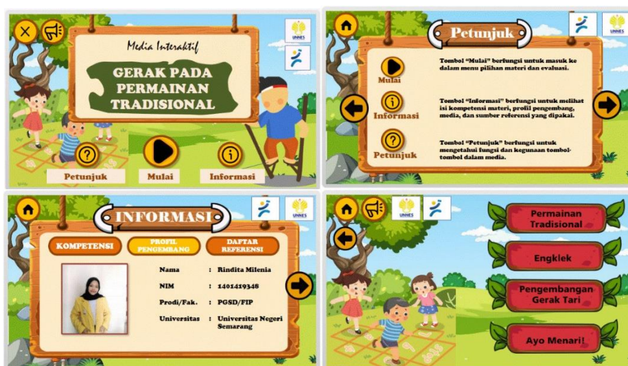
Figure 2. Interactive Media Articulate Storyline

Second, The design of interactive media articulate storyline. Results are the main part of scientific articles, containing: final results without data analysis process, hypothesis testing results. Results can be presented with tables or graphs, to clarify the results verbally. Discussion is the most important part of the entire contents of scientific articles. The objectives of the discussion are: answering research problems, interpreting findings, integrating findings from research into existing sets of knowledge and composing new theories or modifying existing theories. Third, Development of interactive media articulate storyline. The development phase is the third phase in the development of the ADDIE model. In this phase, the plans that have been made at the design stage will be incorporated into the Articulate Storyline media. Here are the results of the Articulate Storyline media shown in Figure 2.