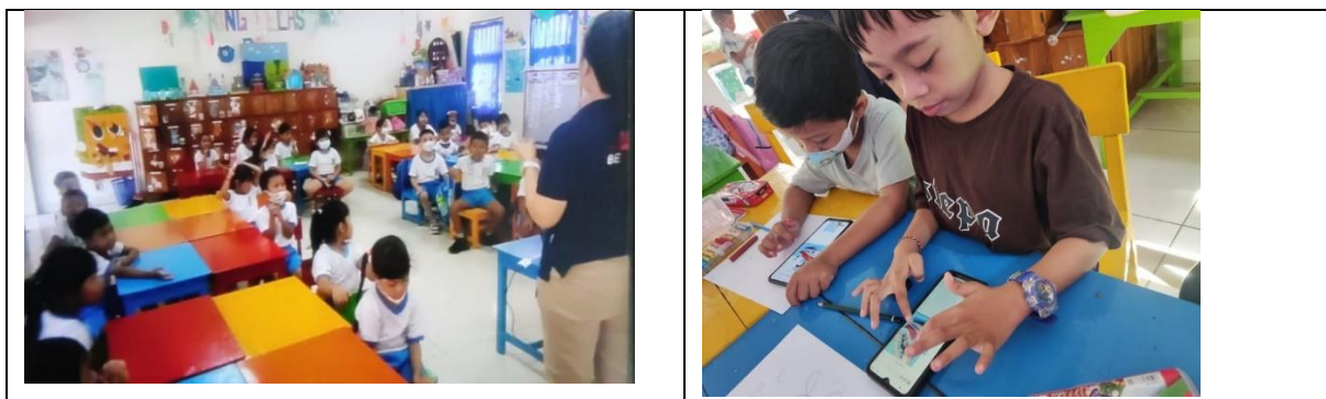
Figure 4. The Application of Multimedia in the Classroom

Based on Figure 4, Interactive multimedia is applied in the classroom by means of independent learning. Every student is given the opportunity to study independently via smartphone. Students who do not bring cell phones are given the opportunity to study through the group method. The development of students' multiple intelligences was observed using observation sheets. The types of intelligence observed are mathematical logic, music, language, kinesthetic and spatial. Data showed that the results of the first meeting showed that the average Logical intelligence was 68, Music 72, Kinesthetic 75, Spatial 97, and Linguistics 79. If you look for the overall average it is 78 (in the good category). Based on these results showed that the results of the fourth meeting showed that the average intelligence was 96 in Logic, Music 96, Kinesthetic 97, Spatial 100, and Linguistics 100. If you look for the overall average, it is 98 which is at a very good qualification level. Thus, there has been an increase in intelligence from each meeting I with an average score of 78 is in the good category, meeting II with a score of 85 with a good qualification level, meeting III with a score of 91 with a very good qualification level, meeting IV with a score of 98 with a very good qualification level.