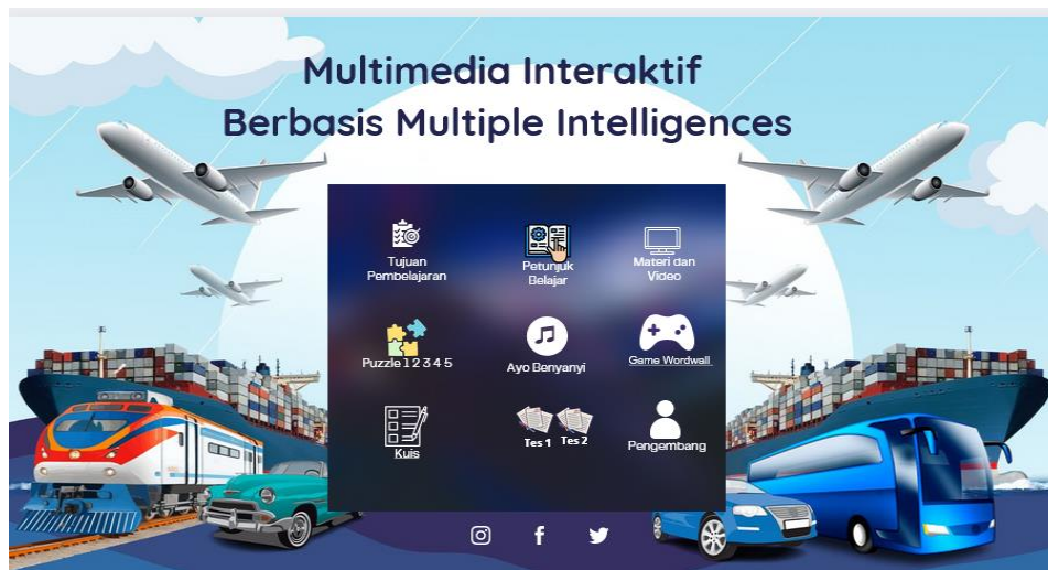
Figure 1. Interactive Multimedia Display

Figure 2 is an interactive multimedia home page display. The multimedia homepage display contains text and image elements, which function to make it easier for users to understand the navigation functions on the homepage. The use of image dissertation icons is also to maximize the user experience in interpreting and understanding the information presented. Apart from that, the choice of color on the multimedia dashboard has a crucial role because it functions as more than just an aesthetic element. These colors are used to draw children's attention to certain areas or information on the dashboard. Colour can help users focus on the most important data points.