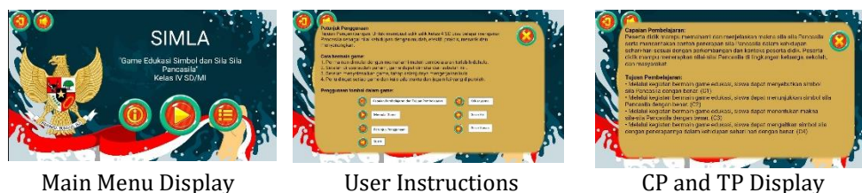
Figure 2. Cover Design and Educational Game Content

In the initial stage, interviews were conducted with fourth-grade teachers to find out the problems in PPKn (Pancasila and Citizenship Education) learning at SD Negeri 2 Kauman. Results of interviews with fourth-grade teachers (IVB): 1) Only use the teacher's manual in Pancasila and Citizenship Education learning. 2) Limited availability of media and teaching materials. 3) It is felt that there are difficulties with students' learning speed and delivery of PPKn material, especially regarding Pancasila. 4) There needs to be more variety in teaching materials, which hampers the learning process. The design stage begins by taking steps to design the product. The educational game-based learning product developed is in line with PPKn (Pancasila and Citizenship Education) Learning Achievements (Pancasila and Citizenship Education) for fourth-grade elementary schools as outlined in Minister of Education and Culture Regulation Number 33 of 2022 concerning Learning Achievements. The development of educational game products is centered on learning outcomes related to learning achievements and focuses on Pancasila as the core value of life. Next, the design process includes defining the educational game content and creating a cover and content template. Content design was done via the Microsoft Word application, while Canva was used to create the cover. This game content development uses the Construct 3 application. The appearance of the resulting product can be seen in Figure 2.