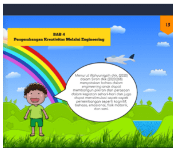
Figure 5. Development of Engineering Creativity

The fifth finding relates to the development of engineering creativity. Engineering is the ability to engineer technological developments. Kipper in Siron states that early childhood engineering abilities must be developed more deeply. Engineering content can be the main guide in learning because the field emphasizes psychological aspects and social interactions, which are important factors in learning—starting with identifying the problems faced and then looking for solutions. For example, students try to transfer water from one bucket to another using a dipper, then build thoughts and ideas by looking for other tools that can be faster, for example, using a hose and water pump. It is where aspects of cognitive, language, emotional, physical development, motor, and art are grown. Based on the results of the engineering creativity development questionnaire, it was found that the e-book innovation of early childhood creativity development in this engineering activity, 53.7% of students stated that the e-book image design was made attractive, 72.2% stated the essence of engineering material was understandable, 50 % of song selection relates to engineering play activity material, 57.4% of engineering play activity selection can be followed by children, and 64.8% technology play activity video tutorials can be understood. The display of engineering creativity development can be seen in Figure 5.