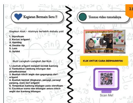
Figure 7. Development of Mathematical Creativity (Mathematics)

The seventh finding relates to mathematical creativity. Mathematics is important to equip early childhood to think logically, systematically, critically, analytically, full of new ideas, and social skills. Developing the concept of learning mathematics in early childhood can be done, among other things, by developing the concept of numbers in children, developing concept patterns and relationships, developing the concept of geometrical relationships, developing the concept of measurement, developing the concept of collecting, organizing and displaying data. Based on the results of the mathematical creativity development questionnaire (figure 8), it was found that e-book innovations developed early childhood creativity in this mathematical activity, 57.4% of students stated that the e-book image design was made attractive, 79.6% stated the essence of mathematical material understandable, 53.7% of song selection relates to math play activity material, 64.8% of math play activity choices can be followed by children, and 59.3% math play activity video tutorials can be understood. The display of mathematics creativity development can be seen in Figure 7.