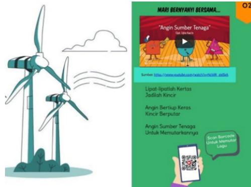
Figure 2. Selection of Activity Songs According to the Theme

The second finding shows that 83.3% of the songs used are according to the theme. Meanwhile, 66.7% of the songs used in this e-book come from YouTube. Meanwhile, 22.2% used self-made songs, and 22.2% edited the songs well. Furthermore, as much as 3.5% use songs from other sources. In this e-book, the songs chosen are the wind as a Source of Energy (p.02), my balloon (p.12), and The Song of the spinning fan (p.22). The lyrics section provides text using English and Indonesian (p.16). The song activity selection display can be seen in Figure 2.