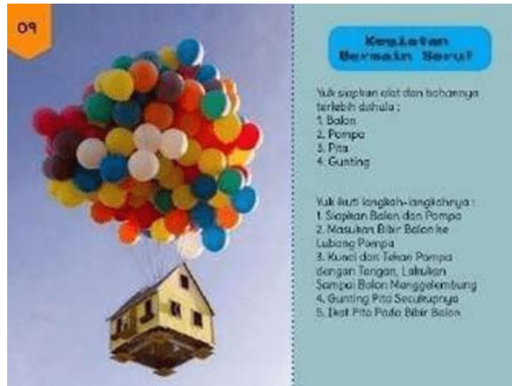
Figure 4. Development of Technology Creativity (Technology)

on the results of the questionnaire, it was found that e-book innovations developed early childhood creativity in this technology activity. 59.3% of students stated that the e-book image designs were made attractive, 70.4% stated that the essence of technology material was understandable, 57.4% stated the selection of songs related to technology material, 61.1% of the selection of technology play activities could be followed by children, and 51.9% video tutorials of technology play activities can be understood. The display of technology creativity development (Technology) can be seen in Figure 4.