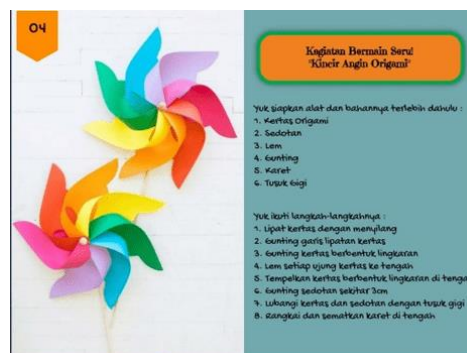
Figure 3. Development of Scientific Creativity (Science)

The fourth finding shows that the second play activity for developing STEAM-based early childhood creativity is the use of technology. Technology is used as a medium for conveying interesting and interactive learning messages. In this non-stop development, the world of education cannot escape the need for technology, which ultimately changes learning patterns for developing creative and innovative skills. Based