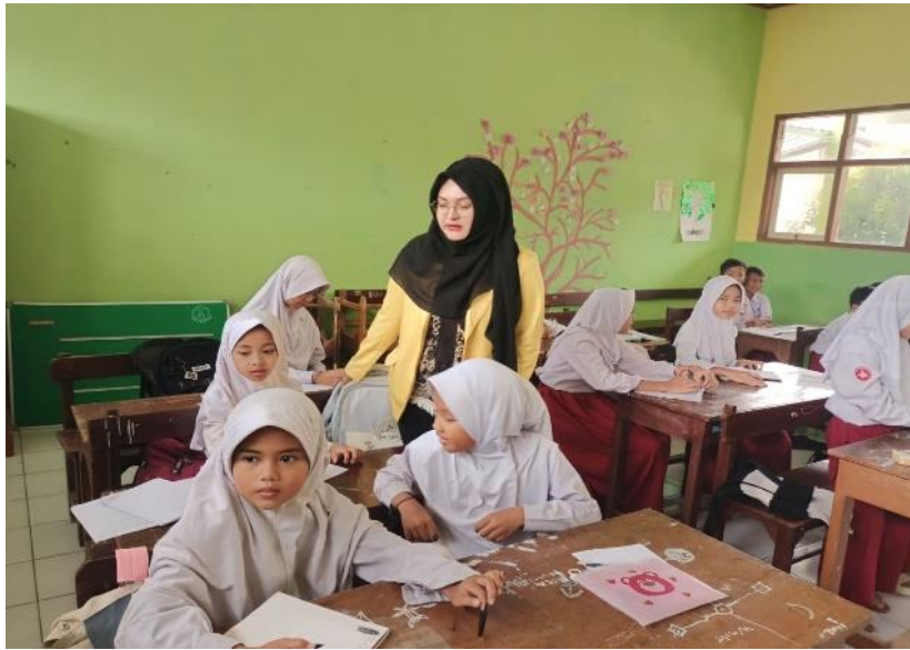
Figure 2. Formation of Multicultural Groups

more cheerful and happy because they can change seats. This strategy can increase students' enthusiasm in participating in class learning. This looks like in Figure 2 .