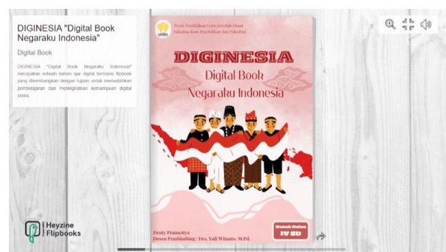
Figure 1. Cover Page

The third stage in this research is the development stage. At this stage, the digital book product development process is carried out by collecting several materials obtained from several relevant material sources, such as teacher books, student books, and others. All materials such as text, images, audio, video, and infographics included the digital book, then designed through the Canva application. This design adjusted to the characteristics of students so that the content in the digital book can be easily understood by students. After the digital book design is complete, the results are entered into the Heyzine website to be converted into a flipbook. The final product will be stored on the website and later shared with students in the form of a link or barcode. Learners and educators can access this digital book through a smartphone or laptop by requiring an internet network. Part of the flipbook-based "DIGINESIA" teaching material consists of, cover page in Figure 1 ; preface and table of contents in Figure 2 ; book instructions, learning outcomes, and learning objectives in Figure 3 .