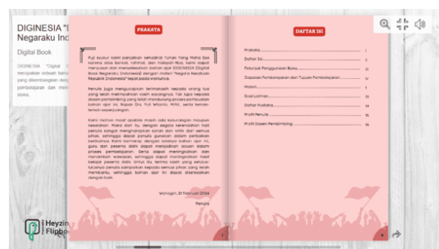
Figure 2. Preface and Table of Contents