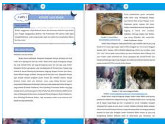
Figure 5. On of the core learning activity in the e-worksheet

A set of E-Worksheets consists of six subtopics of learning activities that students must engage in, encompassing concepts related to reaction rates, collision theory, the impact of concentration on reaction rates, the effect of temperature on reaction rates, the influence of surface area on reaction rates, and the role of catalysts in reaction rates. To enhance the engagement and relevance of the E-Worksheet, it is enriched with discussions on the local wisdom of Brebes, Central Java. This encompasses discussions on the production of boiled salt from Kaliwlingi, the Lawa Songgom cave in Brebes, and the utilization of shallots in the practical application of the reaction rate concept (E-Worksheet 1). It also includes discussions on Emping Melinjo production related to collision theory (E-Worksheet 2), discussions on salted eggs related to the concentration factor in reaction rates (E-Worksheet 3), discussions on Kaligua tea related to the temperature factor in reaction rates (E-Worksheet 4), discussions on Blengong satay related to the surface area factor in reaction rates (E-Worksheet 5), and discussions on Blusder cake related to the catalyst factor in reaction rates (E-Worksheet 6). An example of a fundamental learning activity in the E-Worksheet is depicted in Figure 5 and Figure 6.