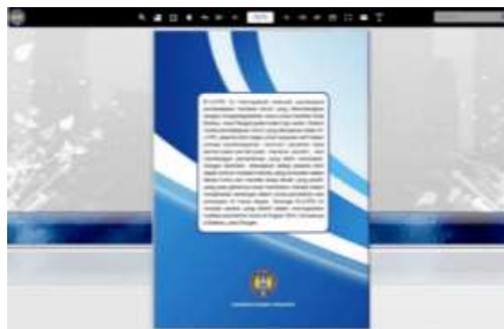
Figure 2. Back cover

The Core Competencies and Basic Competencies employed in the development of the E-Worksheet are based on the 2013 revised curriculum for topics related to reaction rates. Competency Achievement Indicators are formulated as a means of assessing the degree to which students have effectively grasped the content covered in the E-Worksheet. Learning objectives are crafted to offer clear direction regarding what is anticipated of students to accomplish during the learning process of reaction rates. Additionally, the E-Worksheet also offers a concept map designed to aid learners in building their comprehension of the chemical reaction rate concept while incorporating the cultural elements and local wisdom of Brebes, Central Java, that are part of their surroundings. In this concept map, essential concepts related to reaction rates, such as chemical reactions, collision theory, and factors affecting reaction rates, are illustrated as interconnected with elements of Brebes' local wisdom, including local cuisine, cultural heritage, or local traditions, as presented in Table 4.