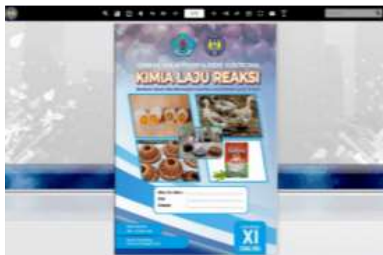
Figure 1. Front cover

hypotheses, designing experiments, carrying out experiments, analyzing data, and drawing conclusions. The cover of the E-Worksheet was meticulously crafted using CorelDRAW, incorporating complementary images that represent different aspects of Brebes' local wisdom. The cover is designed with a balanced blue color scheme, measuring 21.0 cm x 29.7 cm to align with the standard A4 paper size. Moreover, the back cover features a brief summary of the E-Worksheet's contents. The front cover and back cover of the E-Worksheet are illustrated in Figure 1 and Figure 2, respectively.