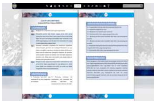
Figure 3. The coverage of competencies, competency achievement indicators, and learning objectives

The scope of competencies, Competency Achievement Indicators, learning objectives, and concept maps can be observed in Figure 3, and Figure 4.