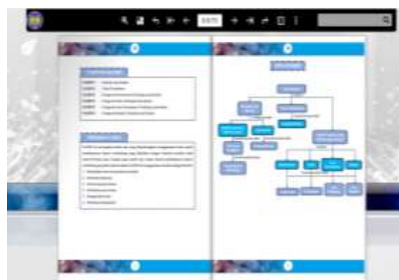
Figure 4. The concept maps