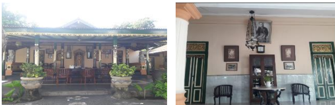
Figure 2. Puri Kanganan is a Heritage of Buleleng Royal Palace

In 2013 the Cultural Heritage in Singaraja City was the Bale Gede House, the Jami Mosque, the Koran, the Temple, and the Governor's Office Soenda Ketjil being proposed to get the Buleleng Regent's Decree. After the inauguration of these five objects, it is essential to include them as part of Singaraja City heritage tourism. Heritage sites in Singaraja mostly related to the Buleleng Kingdom and the civilization of Dutch in Bali. Figure 2 shows the heritage sites in Singaraja city called Puri Kanganan.