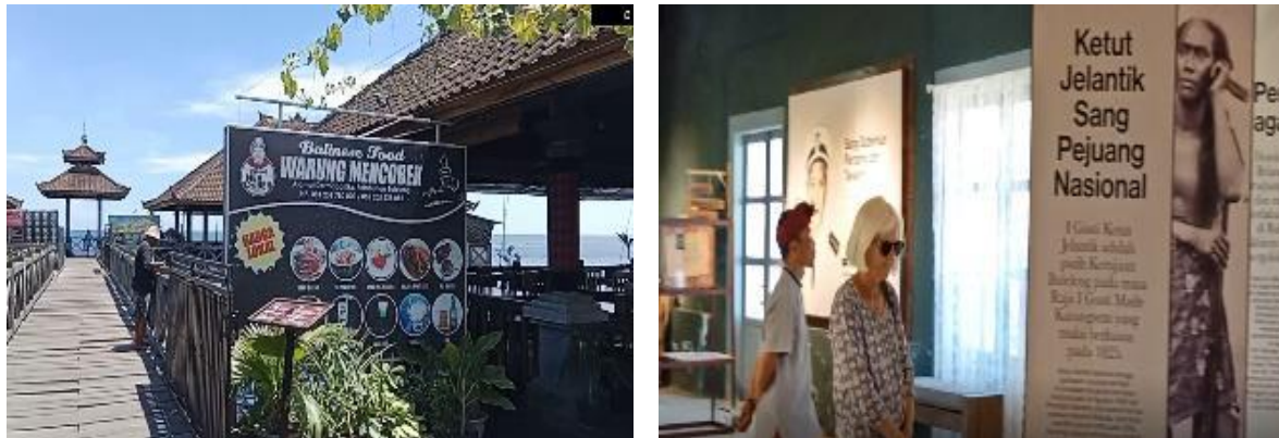
Figure 3. Buleleng Eks-Harbour in the North of Bali

Besides the palace, Singaraja city also has the heritage narratives of Buleleng eks-harbour as the evident of the past glory of Buleleng regency. Buleleng port was the center of Bali's trade in the past. The trade volume that once occurred is even equivalent to the current busyness of Singapore's ports. The local government has build the Soenda Ketjil museum to present the historical narratives of Buleleng eks-harbour to the visitors. The photos of Buleleng eks-harbour and Soenda Ketjil museum can be seen in Figure 3 .