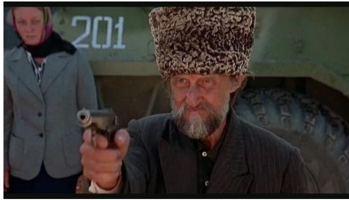
Figure 4. A father shot his son. (01:26:09)

Dina : Дзарахмат умер. Ты проживёшь ещё ночь. Dzarahmat umer. Ty prozhivjosh' eshho noch'. "Dzarahmat is dead. You have one more night to live."