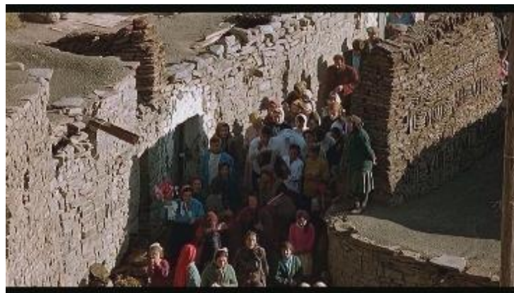
Figure 3. A marriage ceremony. (01:19:11)

The three pictures above show a group of Chechen separatists gathered in their hideout. The Chechen separatists fought against the Russian federal forces using guerrilla tactics because of their smaller numbers compared to the Russian federal forces. Their tactics were so effective against the Russian forces that they managed to maintain their independence for a few more years until the Second Chechen War. Also shown in the above scene is the Chechens' interest in the sport of grappling, which persists to this day. Many Russian MMA athletes are either from Chechnya or train there. A marriage ceremony. (01:19:11) showed in Figure 3 .