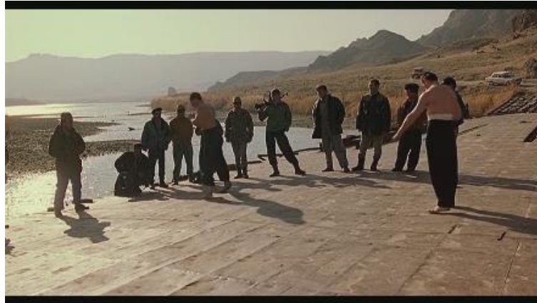
Figure 2. Chechen's Brawling. (01:05:55)

The three pictures above show a group of Chechen separatists gathered in their hideout. The Chechen separatists fought against the Russian federal forces using guerrilla tactics because of their smaller numbers compared to the Russian federal forces. Their tactics were so effective against the Russian forces that they managed to maintain their independence for a few more years until the Second Chechen War. Also shown in the above scene is the Chechens' interest in the sport of grappling, which persists to this day. Many Russian MMA athletes are either from Chechnya or train there. A marriage ceremony. (01:19:11) showed in Figure 3 .