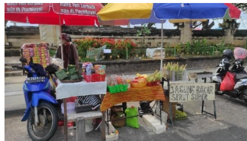
Figure 3 . Vendors Around Kuta Beach