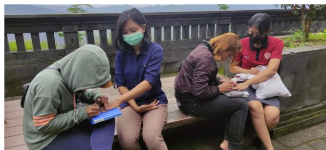
Figure 2. Nail Art at Penelokan, Batur Tengah Village, Kintamani

There are various forms of actors in the informal sector who take advantage of the presence of tourism activities in Bali, namely as photographers, massage therapists, beverage and food traders with carts, beachside stall, meatball traders, hawkers who are better known as acung traders, and nail art. The types of merchandise offered are very varied, from the types of food, drinks, to the color of nail polish. Every actor in the informal sector takes economic opportunities according to their abilities, both based on their ownership of economic capital and their skills. This is implemented by understanding the principles of economics and risk (Obrenovic et al., 2020), which allows them to survive as well as their ability to bear the risks that may happen to them.