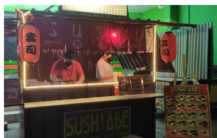
Figure 4. Japanese Food in Jimbaran Region, Bali

In Figure 3, it can be seen that traders peddle food that is usually consumed by the surrounding community. Realizing that most of the tourists who came both before the pandemic and during the pandemic were local tourists, the products sold were food and drinks that were usually needed by the surrounding community. In this case, during a pandemic, local people become their main tourists, so goods that are usually needed and consumed by local people are also served and sold by informal sector actors who offer their products in or around tourist attractions. Local people who visit tourist attractions are not only able to help informal sector actors survive with the products they buy, but are also able to create trends. In addition, foreign foods that are quite popular with local people are finally sold in different portions and presentation ways to be accepted by the local market, including takoyaki, sushi, and other foreign foods.